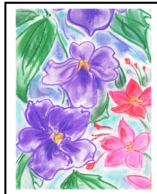
"Aloha Flowers" by Lynne Ciccone ©2004 www.soulfularts.com

Soul-level connection and wisdom are always available - all you need do is ask . But ask you must, for Spirit only interacts when invited, otherwise they patiently watch and wait, respecting the bounds of the "free will" zone in which we live. Powerful and expansive questions are most fruitful, such as "why do I exist".