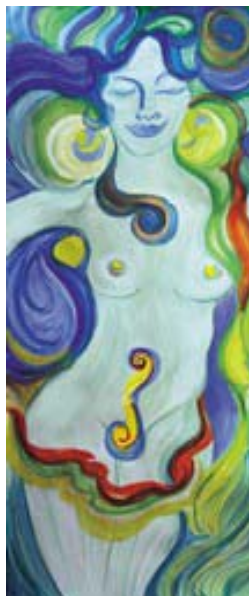
“Goddess of the Waters” by Lynne Ciccone ©1997 www.soulfularts.com